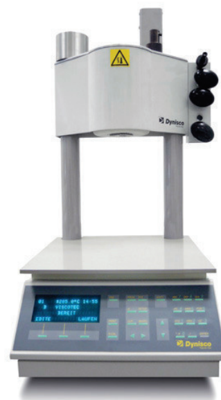
iV – intrinsic viscosity measurement

The benefits of these services are a documented quality assessment acc. to GMP (Good Manufacturing Practice) with a regular quality control including a compact material analysis and structured report, which strengthens the customers position towards suppliers.